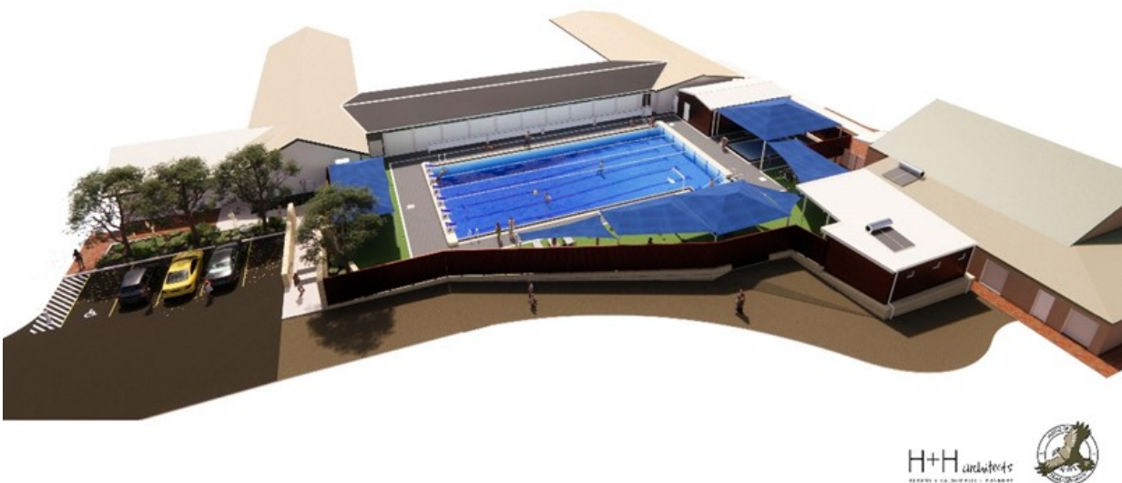
Design Drawings of Proposed Upgraded Facilities