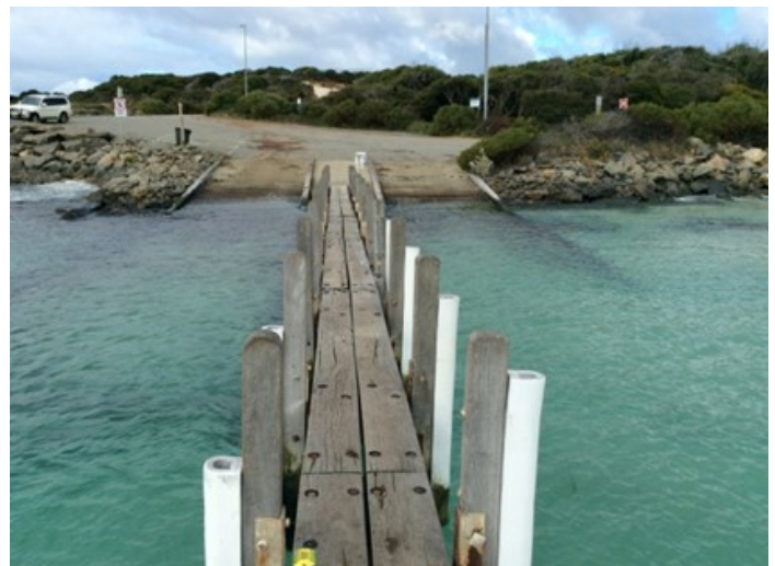
Fishery Beach Marina—Recreational Boat Ramp and Finger Jetty (2017)