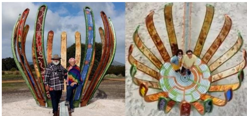
Photographs (above) showing the physical Genestreams sculpture at Twin Creeks, north of Porongurup.

Each sculpture comprises multiple artworks brought together in a cross-cultural approach that tells the ‘deep time’ story of why south-western Australia is such a globally significant place – both for the age of its Noongar cultures and its ecological richness.