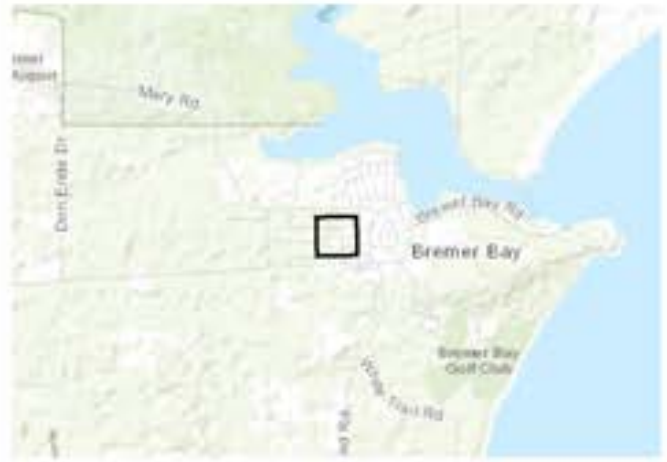
Overview Map Scale 1:100,000