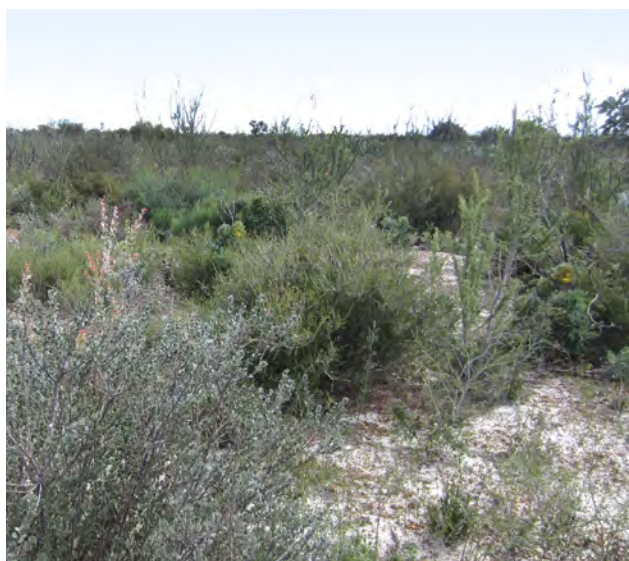
Regeneration following fire, Fitzgerald River National Park (Department of the Environment)