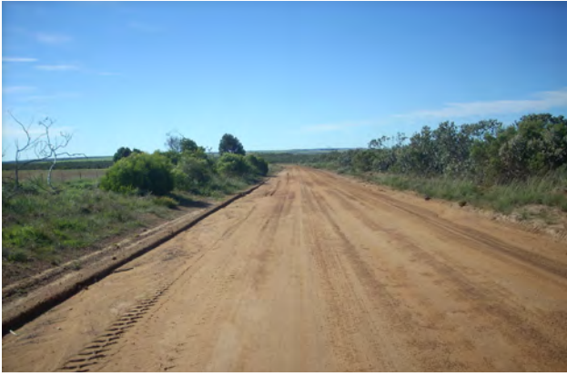
Degraded roadside, showing loss of the ecological community on the left (Department of the Environment)