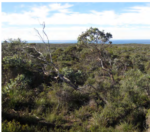
Kwongkan shrublands near Hopetoun

Human settlements and infrastructures where an ecological community formerly occurred do not form part of the natural environment and are therefore not part of the ecological community. This also applies to sites that have been replaced by crops and exotic pastures, or where the ecological community exists in a highly-degraded or unnatural state.