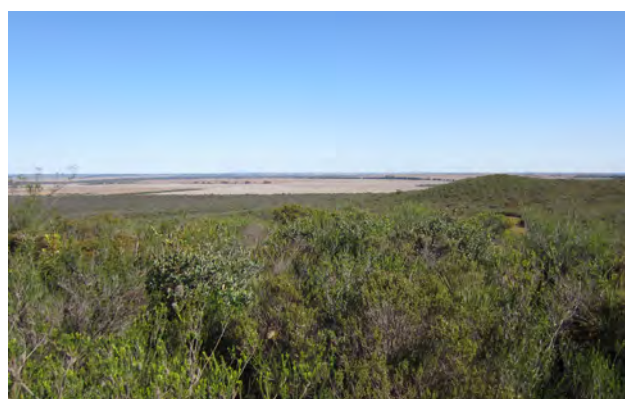
Fitzgerald River National Park and surrounding lands

A large portion of the ecological community has already been lost and remaining areas are vulnerable to the impacts of threats such as dieback due to Phytophthora cinnamomi , changing fire regimes, land clearing, invasive species, and climate change. Some of these threats are also affecting areas of the ecological community that occur in reserves. In many areas it now mostly exists as small and fragmented patches. Protection will contribute to a region that is better able to cope with environmental fluctuations and changes.