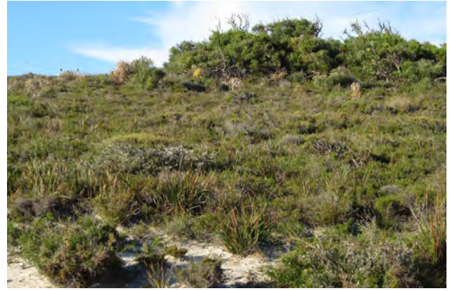
Loss of dominant tall structure due to dieback of Banksia speciosa (showy banksia), Cape Le Grand National Park