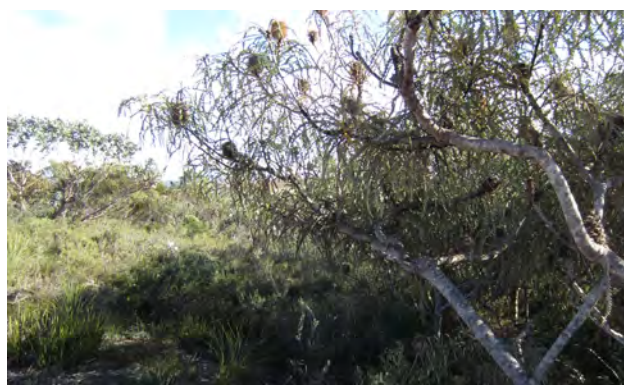
Banksia speciosa (showy banksia), a key species in some parts of the ecological community (Department of the Environment)